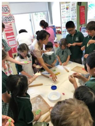
Pictures below clockwise: Lotus Mandarin’s fun activities – Making Chinese dumplings; Chinese tea appreciation; Students learning Chinese calligraphy; Students performing drama play.