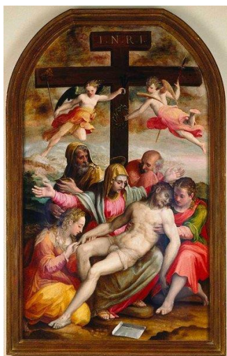
Deposition 1543 or 1563 By Prospero Fontana

This was a Renaissance altar piece. It has the images of the angels, Mary Magdalene and the cross. The image has been described as allowing the viewer to come into the physical suffering of Christ and the story of Easter.