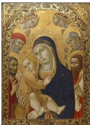
Madonna and Child with Saints Jerome, John the Baptist, Bernardino and Bartholomew 1450-81 by Sano di Pietro

Below are some of the art pieces we saw: