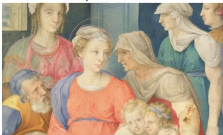
The Holy Family with St. Elizabeth, St. John the Baptist and Three Noblewomen, c.1557 (vellum), Clovio, Giorgio Giulio (1498-1578)

The Holy Family with St Elizabeth, St John the Baptist and Three Noblewomen Illumination on vellum, c.1557 by Clovio, Giorgio Giulio (1498-1578)